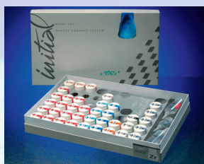
GC Initial Zr Basic Set