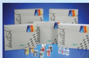
GC Initial AL Entrance Kit

Consists of small quantities of the key ceramics, shade ceramics and liquids to test on a limited number of restorations.