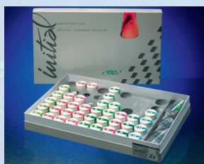
GC Initial Zr Advanced Set