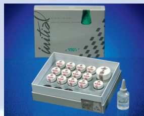
GC Initial INvivo/INsitu for AL, Zr, Ti

Effect materials for internal-external use