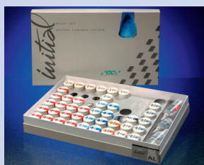
GC Initial AL Basic Set

Contains all the fundamental opaque ceramics, shade ceramics and liquids. Designed for basic, standard build-up and to meet the 'standard' requirements of the Vitapan® Classical shade guide.