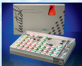
GC Initial AL Advanced Set

Completes the GC Initial system by adding the remaining shades and accessories to the Basic Set so enabling restorations with the most advanced aesthetics.