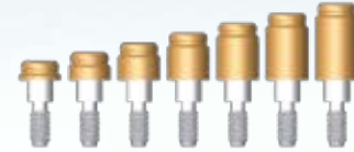
LOCATOR Implant Abutments Many Tissue Cuff Heights are available.

The LOCATOR Core Tool (8393) is necessary for abutment placement and nylon male placement & removal; includes Male Removal Tool, Male Seating Tool, and Abutment Driver, shown with optional Abutment Holder Sleeve (8394). Various torque wrench connection types of insert drivers are available to achieve optimum 30N-cm of torque.