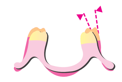
Spherical deformation in conjunction with conventional polymerization according to Prof. Dr. K. H. Körber, Kiel (Germany)

Controlled polymerization prevents an increase in vertical dimension and spherical deformation. As a result, time-consuming adjustments of occlusion can virtually be eliminated.